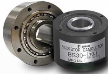
Backstops & Overrunning Clutches