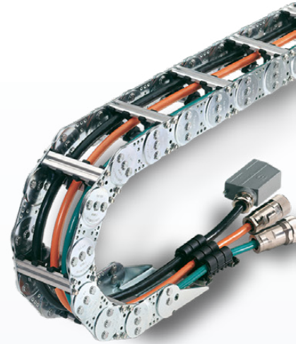
Steel Cable Carriers