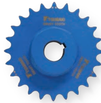
SMART TOOTH® SPROCKETS