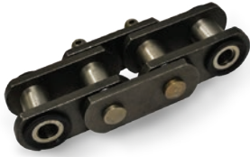
SEALED JOINT CHAIN OPTIONS