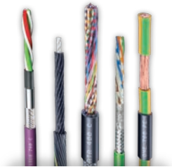
CONTINUOUS- FLEX CABLES