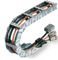
STEEL CABLE CARRIERS