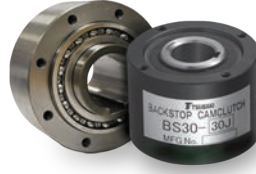
BACKSTOPS & OVERRUNNING CLUTCHES